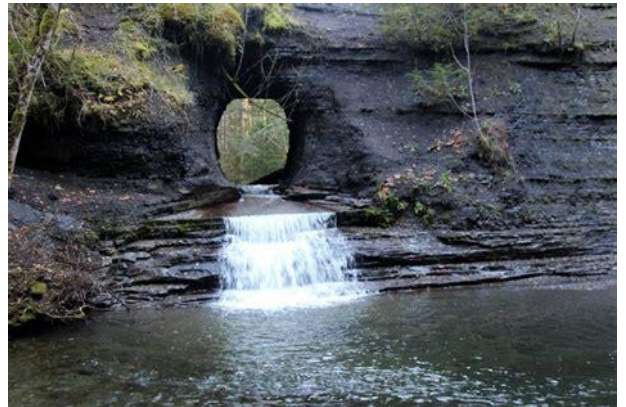
Roger Creek Nature Trail – Log Train Trail