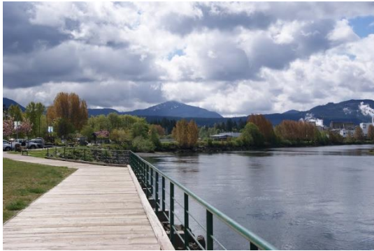
Harbour Quay – Centennial Pier – Tye Landing