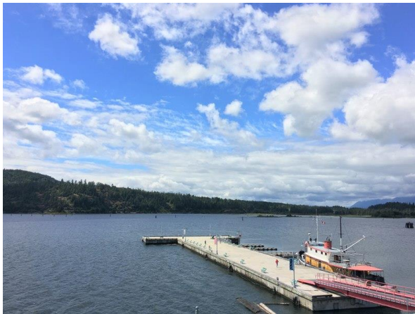
Waterfront Park - Canal Beach