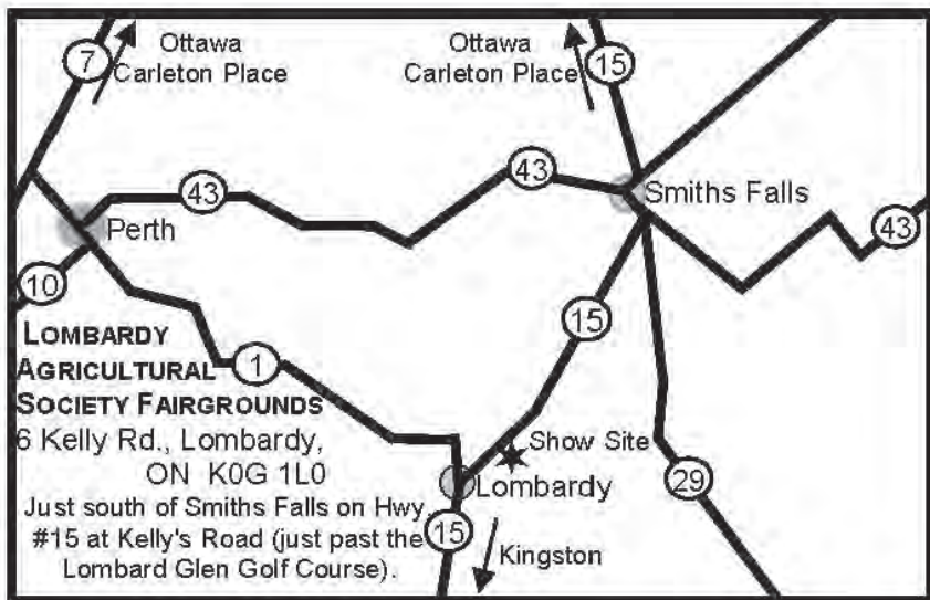
(Please Note: Map is for reference only please refer to an official city map)