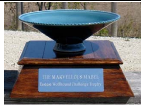
THE MARVELLOUS MABEL FASTEST WOLFHOUND CHALLENGE TROPHY

Please forward trophy donation to any member of the performance committee All contributions are appreciated and needed.